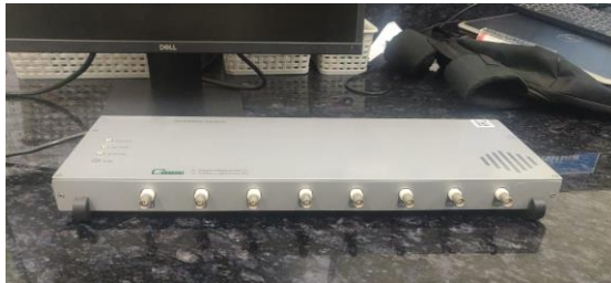
Figure 1. Existing data acquisition system( the dynamic amplifier/analyzer must be compatible with the existing DAQ