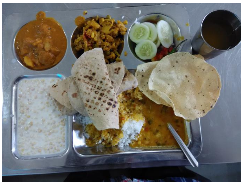
Typical Lunch plate