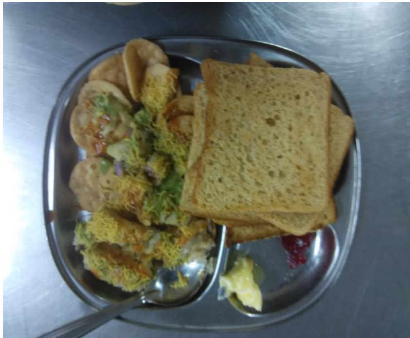
Typical Evening Snacks Plate