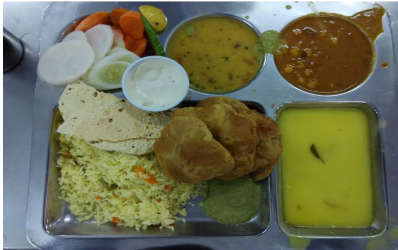
Typical Dinner Plate