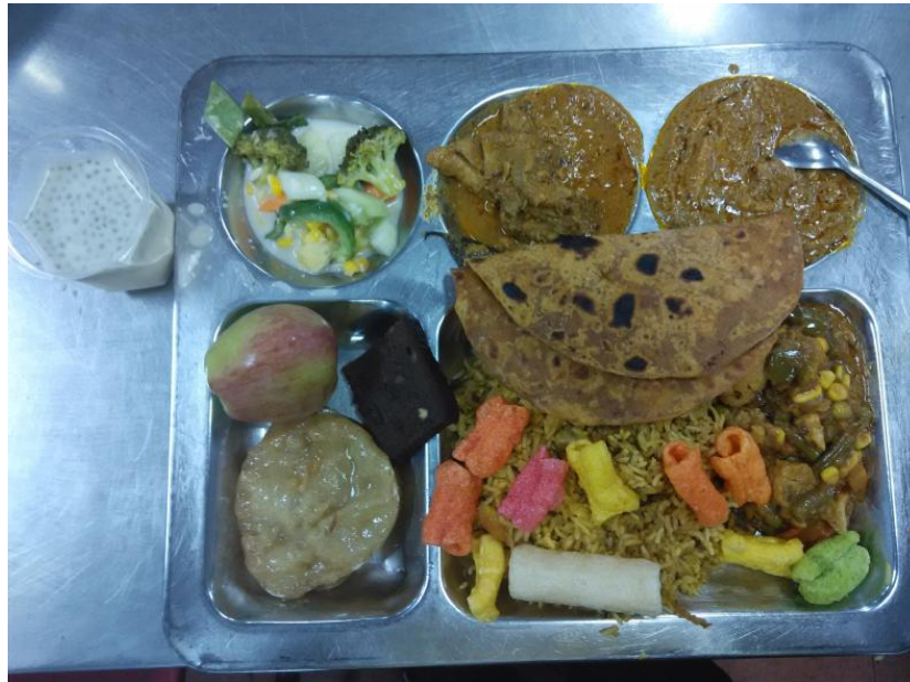
Typical Grand monthly Dinner Plate